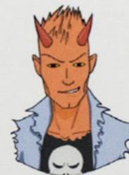
Satan's Personal Statistics Slave